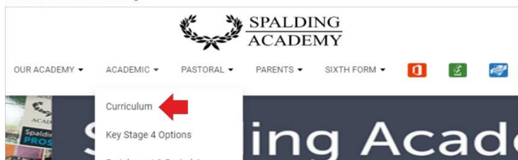
Menu on desktop