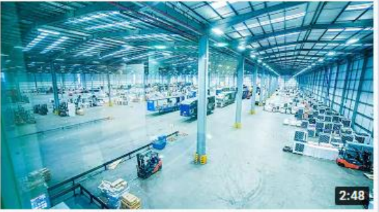
Study Logistics Management at Derby

https://www.youtube.com/watch?v=FG0EUtxr6BE