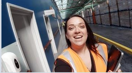
Logistics Project Manager for Wincanton

https://www.youtube.com/watch?v=Knlqrbl7dYs