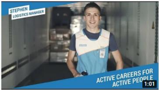
Logistics Manager at Decathlon

https://www.youtube.com/watch?v=TpKE9xhIOnQ