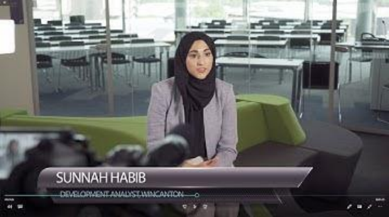
Why choose Logistics?

https://www.youtube.com/watch?v=YfZBW-ox0uU