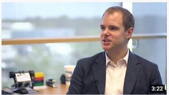
Supply Chain Manager Nestle Foods

https://www.youtube.com/watch?v=bQKE5Uu5TNo