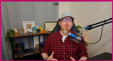
How to get a Job in the Video Games Industry in 2025