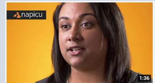
Psychologist in a Psychiatric Intensive Care Unit (PICU)

https://www.youtube.com/watch?v=BmHrz2ugbD4